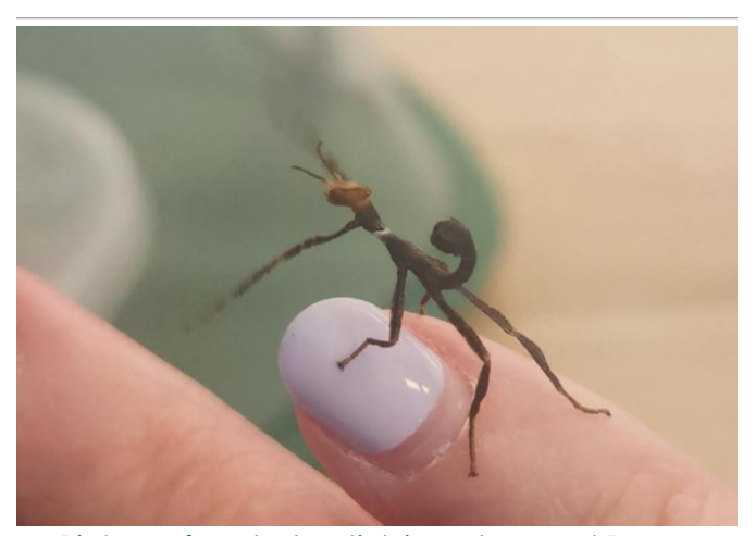
Picture of our baby stick insect named Remy, named after Remy in Prep who found him on Monday morning with the egg still attached to it.

By understanding the distinction between these tiers, we can better align our support with the needs of each student, ensuring the intensity and approach match the complexity of their challenges.