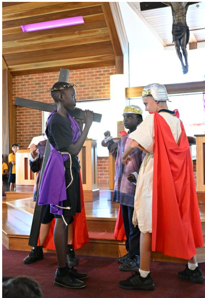
Students Acting Out The Stations Of The Cross